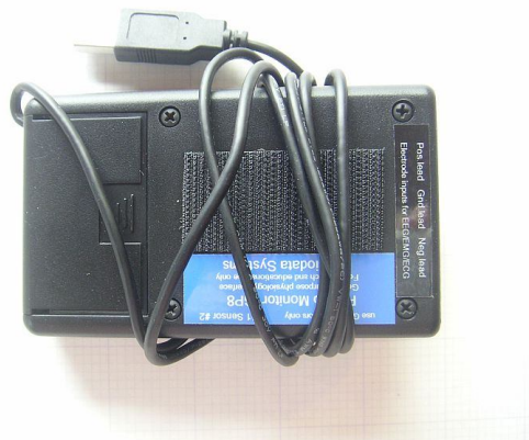
Never wind cable around case or bend sharply at case entry.