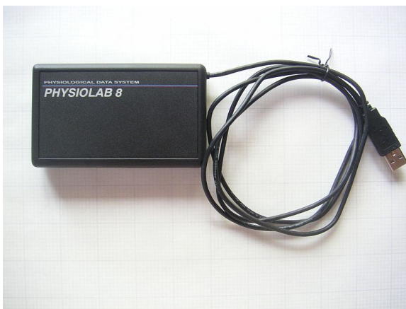
Store the attached cable with large open loops.