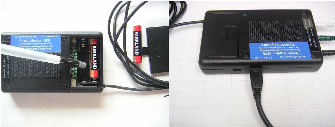
Carefully remove battery cell with tip of ballpoint pen.